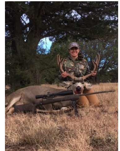
270 Sherman 170 Berger

*62.7 grains RL 26 2972 fps Norma CCI BR-2