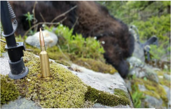
270 SS 165 Matrix

59.2 grains RL 23 2999 fps 2.266" BTO ADG CCI 200 62 grains RL 26 2979 fps 2.268" BTO Norma Fed 210